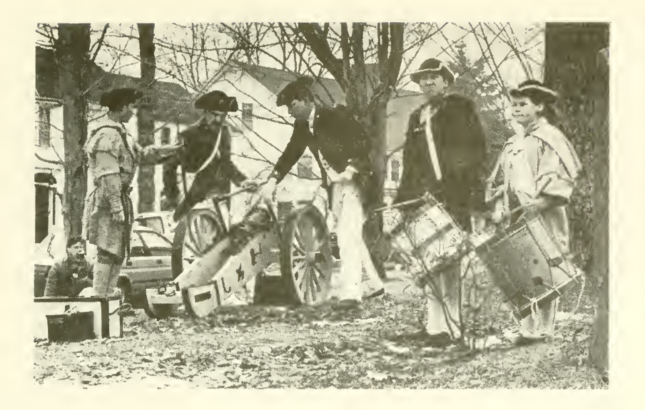
Musket volley and cannon roar to commemorate the spirit of the Militia as the colonists prepare for revolution.