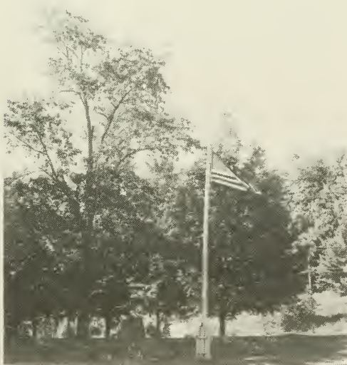
Madbury Town Common Madbury Rd/Route 155

One of the many tributes throughout Madbury as a result of the events of 9/11/01