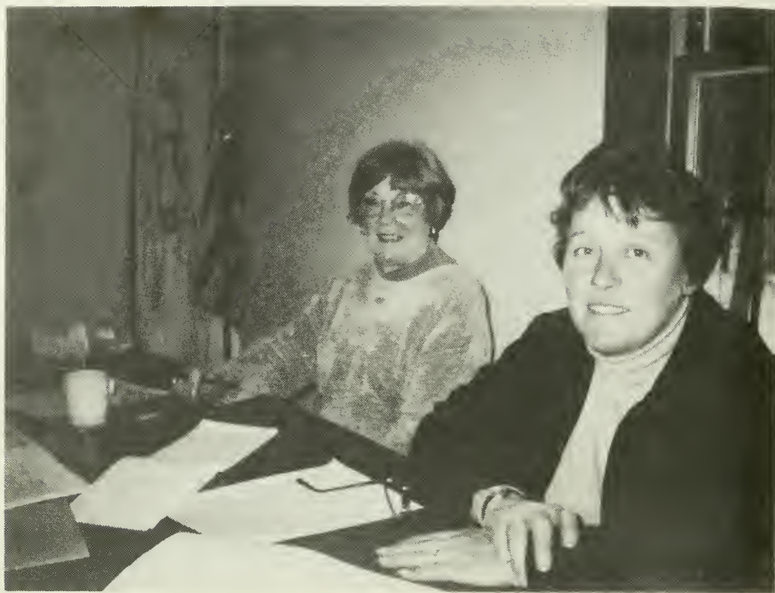
Town Auditors reviewing all Town Accounts