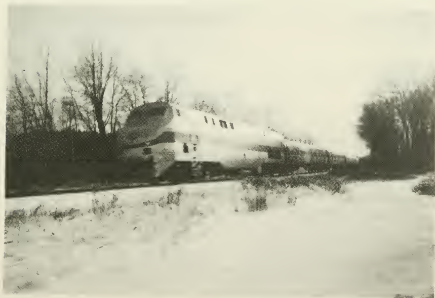
Route 155 Railroad Crossing 2001