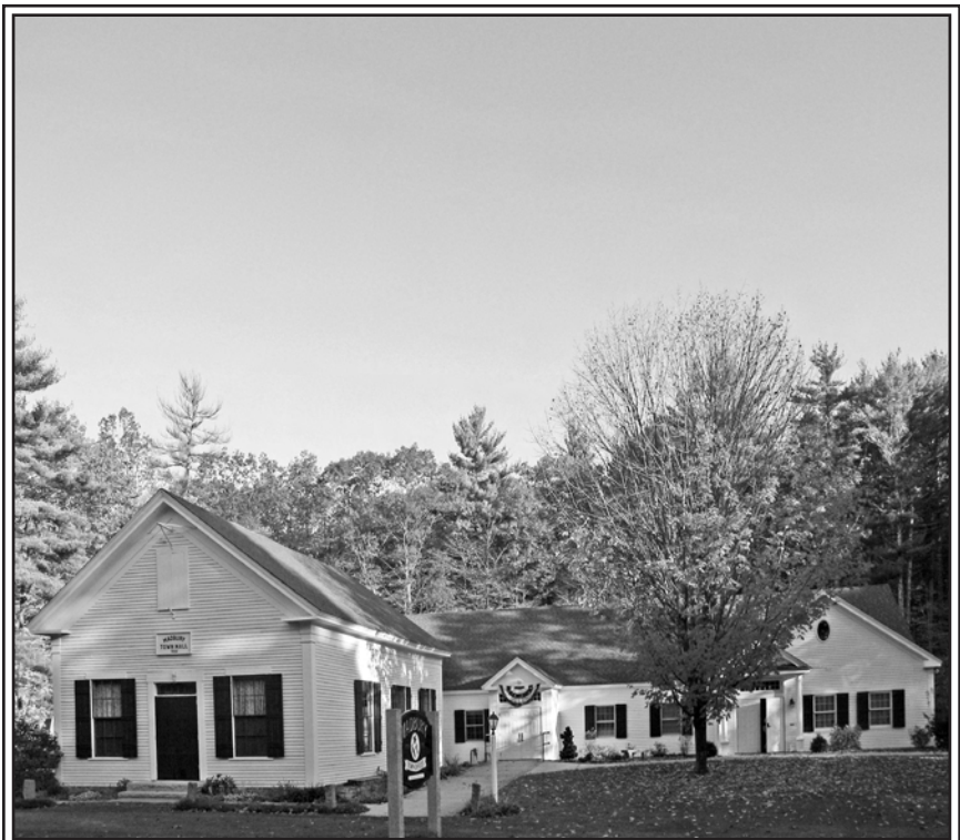
Madbury Town Hall, Autumn