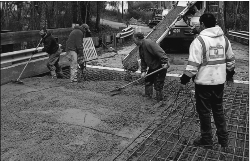
AJ Hartford (right) oversees pouring of the new deck on the Nute Road Bridge over the Bellamy River.