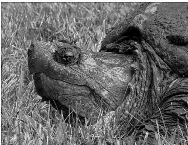
Periodic visitor to 61 Moharimet Dr.