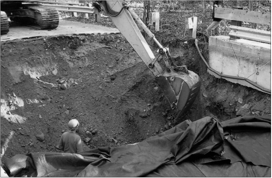
Careful digging prior to pouring new footings at the Nute Road Bridge over the Bellamy River.